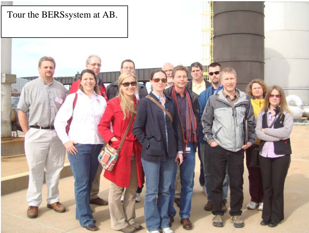
Tour the BERSsystem at AB.