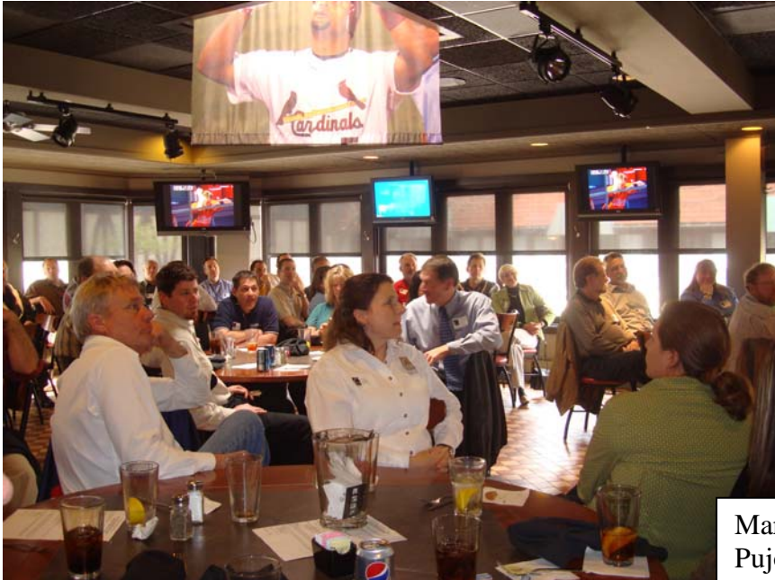
March Monthly Meeting at Pujols 5